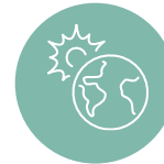
Energy & Climate