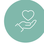
Health, Safety & Comfort