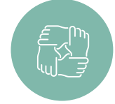
Communities & local support