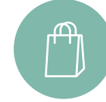
Sustainable Retail Index